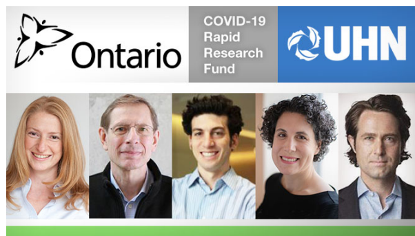
Province Supports Rapid COVID-19 Research /read more